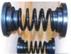
Components of the Coil Steel Sarrina Floor